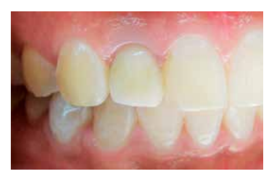
Figure 9. Final screwed-on restoration.