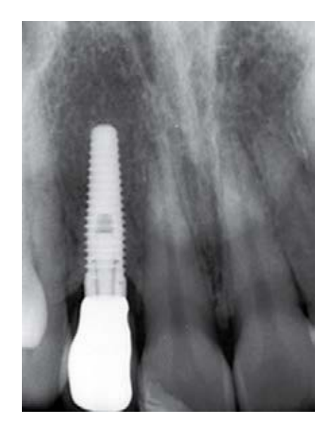
Figure 6. Periapical X-ray.

Final restoration was screwed on with a 15 Ncm torque ( Figure 9 ); 24 months after prosthetic load, mucosa surrounding the implant was found to be in suitable circumstances.