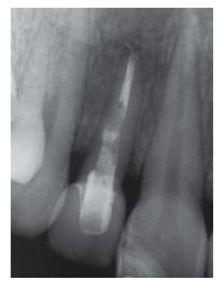
Figure 2. Initial X-ray.

Local, infiltrative anesthesia was applied to the area (2% lidocaine hydrochloride roxicaine) was applied to