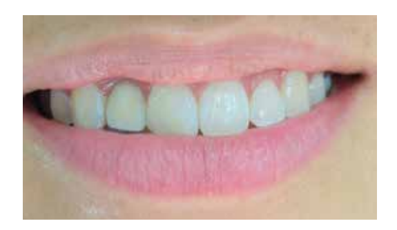
Figure 8. Greyish mucosa around the implant.